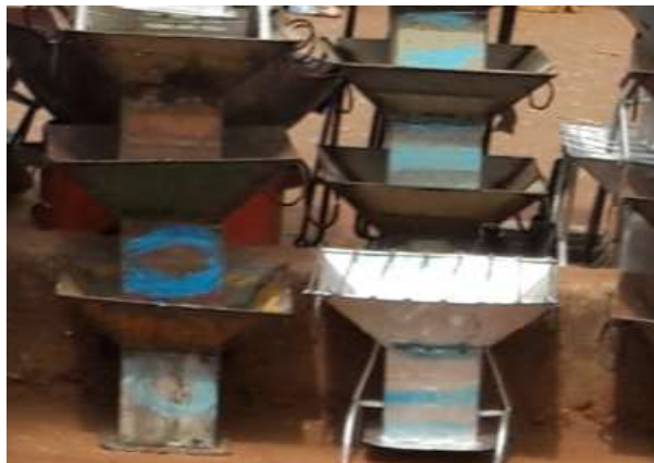
Charcoal stove (square)