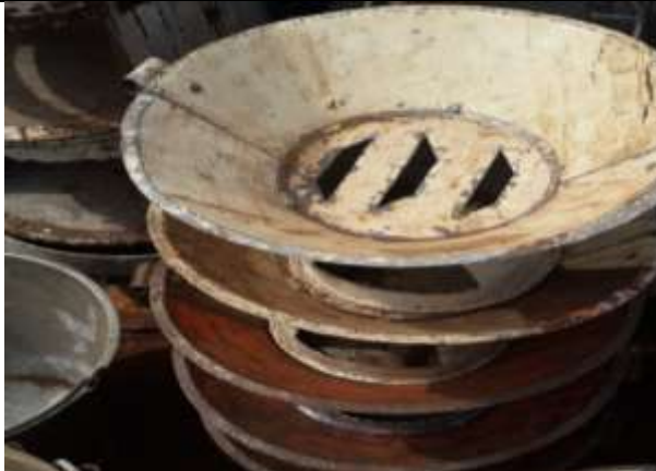
Charcoal stove (Round)