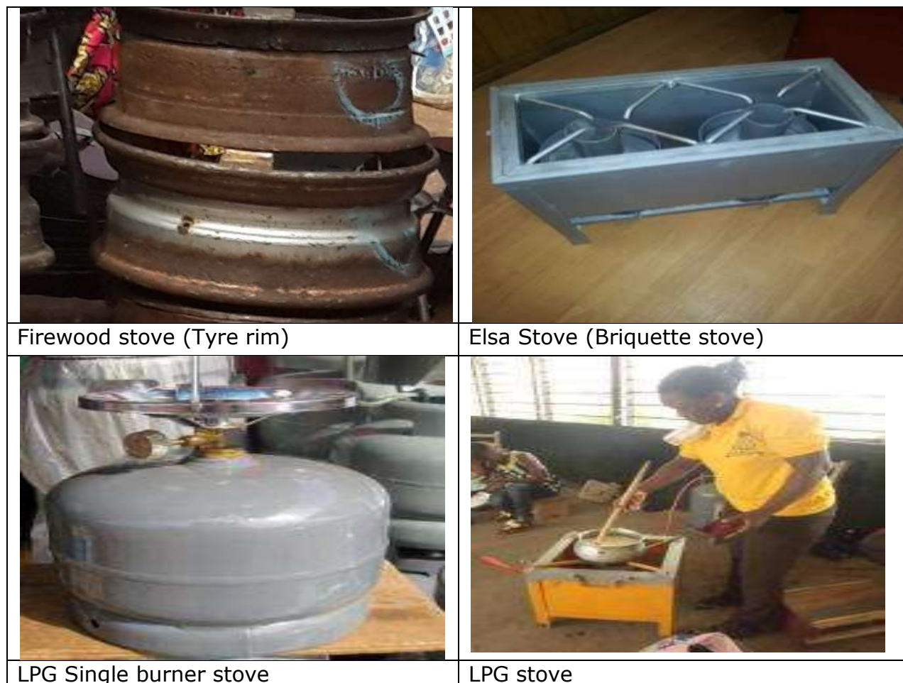
Firewood stove (Tyre rim)