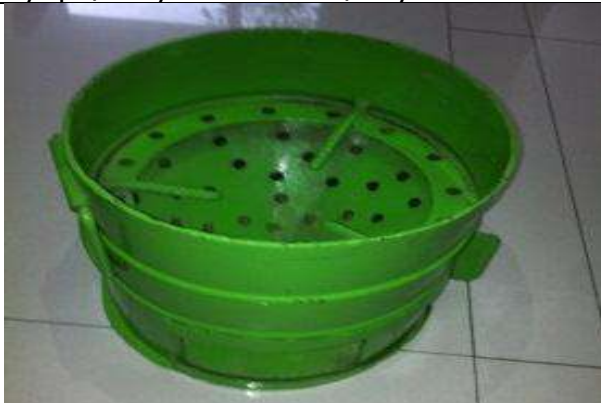
Cook mate by Cookclean Ghana