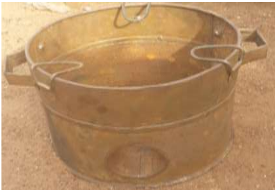
Saw dust/wood chippings stove