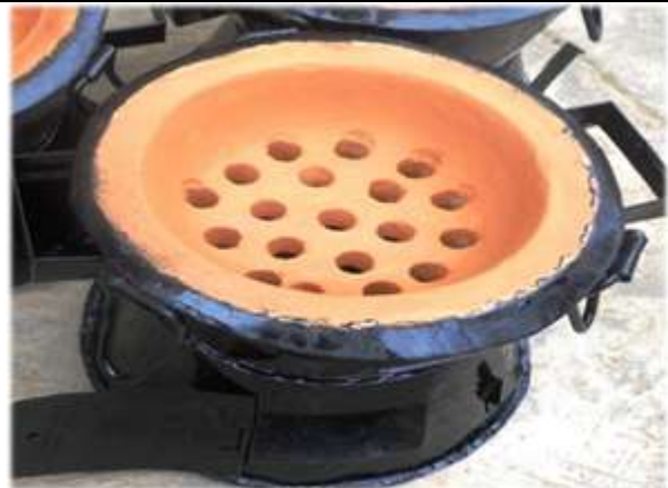
Gyapa/Holy Cook stove/Toyola