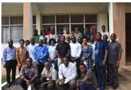
Photo above and below: Training Participants, and Session on Stove Design

The Energy Commission, collaborated with the Centre for Research in Energy and Energy Conservation (CREEC) at the Makerere University in Uganda, to organize a Cookstove Design and Testing Workshop for improved biomass cookstove and liner producers in Ghana. The workshop was held from 27 September 2021 to 1 October 2021 at the CSIR Institute of Industrial Research in Accra.