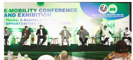
First Panel Discussion

done by the Chief Director of the Ministry of Energy.