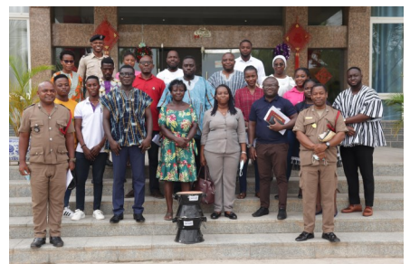
Stakeholders at the Engagement Meeting

Man and Man Enterprise, one of the largest manufacturers of improved biomass cookstove in Ghana, organised a local stakeholder consultation meeting on 9 December 2021 at Tarkwa in the Western Region of Ghana. The meeting is part of requirements for phase two of a Voluntary Programme Activity (VPA) it is implementing under the Gold Standard scheme in partnership with Aera Group. Aera is the largest originator and trader of African carbon credits.