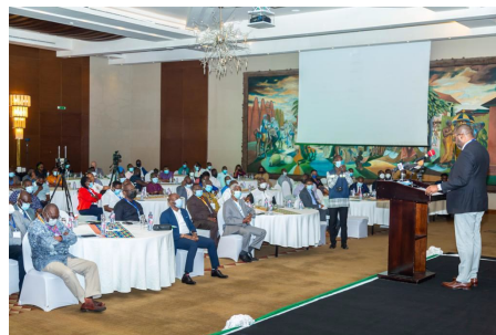
Dr. Matthew Opoku Prempeh, Minister of Energy, Giving the Keynote Address