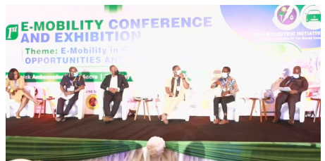
Second Panel Discussion

The second panel discussion was on the subject—challenges for e-mobility in Ghana and proposed solution. It was discussed by representatives from Ghana Revenue Authority (GRA), Driver and Vehicle Licensing Authority (DVLA), National Insurance Commission (NIC), SOMOCO, NODOK Logistics and Ministry of Transport. It was moderated by the project Coordinator of the DEI, Energy Commission.