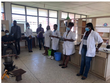
Photo above and below: Training on Basic Stove Testing Protocols, and Session on Stove Design

* Metrics used to evaluate biomass cookstove performance and emissions.