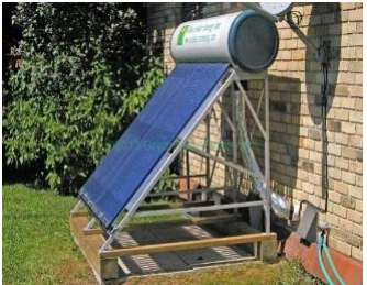
Evacuated Tubes Solar Water Heating System