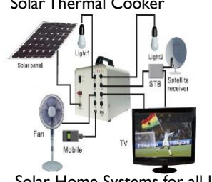
Solar Home Systems for all loads