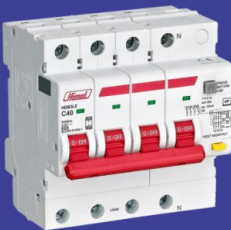
RESIDUAL CURRENT DEVICE

The general public should only buy GSA approved cables and accessories and verify the products authenticity.